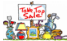
Table Top Sale