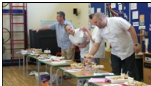
The Judges at work!

The choices are being sent out on Monday so that you are able to select your own individual menus in preparation for your Ardleigh Afternoon Tea Experience!